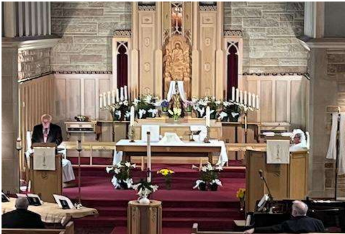
Easter morning 2024 at Sts. Peter and Paul.

What image comes to mind when you think of Easter—Jesus getting up and walking out of the tomb? Actually, none of the resurrection stories gives a detailed description of what happened in the tomb, other than to say that the Crucified One was raised. We are not told that the hand of God reached into the tomb to jostle Jesus from his death sleep, or that the Holy Spirit came into the tomb to give him mouth to mouth resuscitation. Whatever happened in that tomb was something beyond human understanding. So the primary image for Easter is a profound absence: just the empty tomb itself.