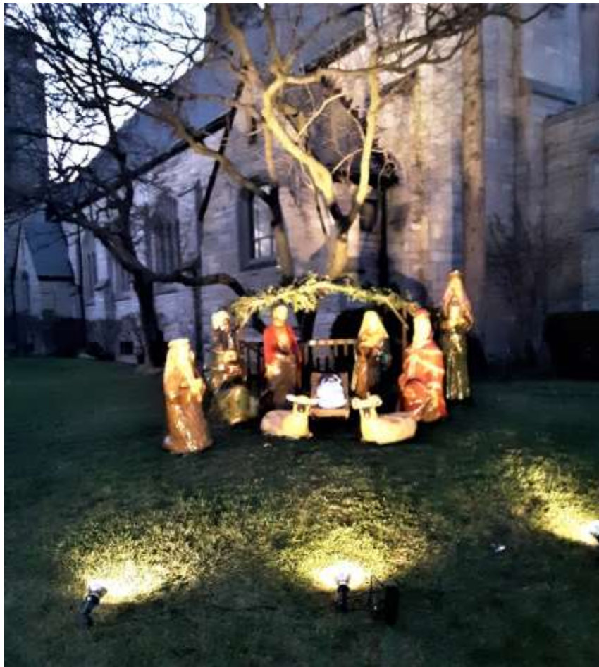
Christmas Eve and Christmas Day

fire prepared for the devil and his angels; for I was hungry and you gave me no food, I was thirsty and you gave me nothing to drink, I was a stranger and you did not welcome me, naked and you did not give me clothing, sick and in prison and you did not visit me.’ Then they also will answer, ‘Lord, when was it that we saw you hungry or thirsty or a stranger or naked or sick or in prison, and did not take care of you?’ Then he will answer them, ‘Truly I tell you, just as you did not do it to one of the least of these, you did not do it to me.’ And these will go away into eternal punishment, but the righteous into eternal life (Matthew 25:31-46).