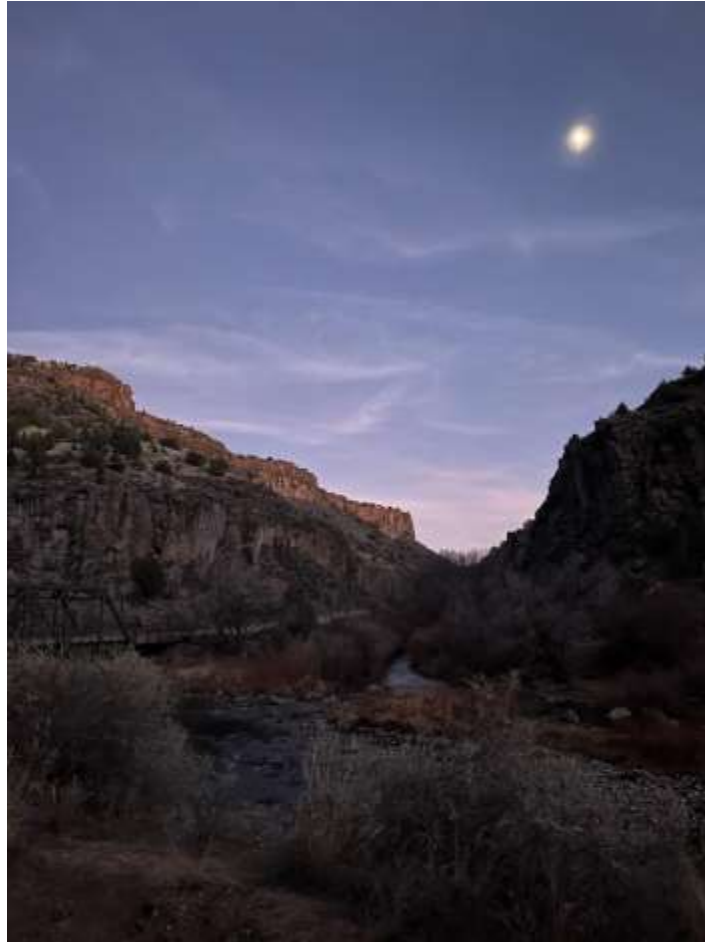
Thanksgiving Eve in New Mexico