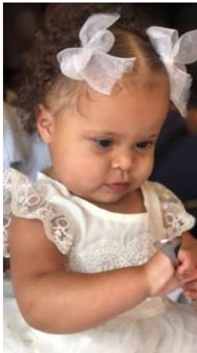
The Newly Baptized