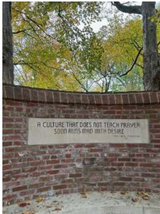
New Harmony, Indiana.