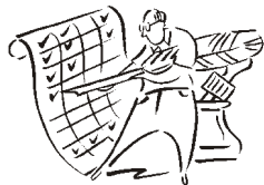
Attendance and Offering Report

Weekly Offering Needed for Budget: $5,961.54