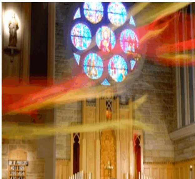
Day of Pentecost Sunday, June 12 th , 2011