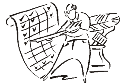
Attendance and Offering Report