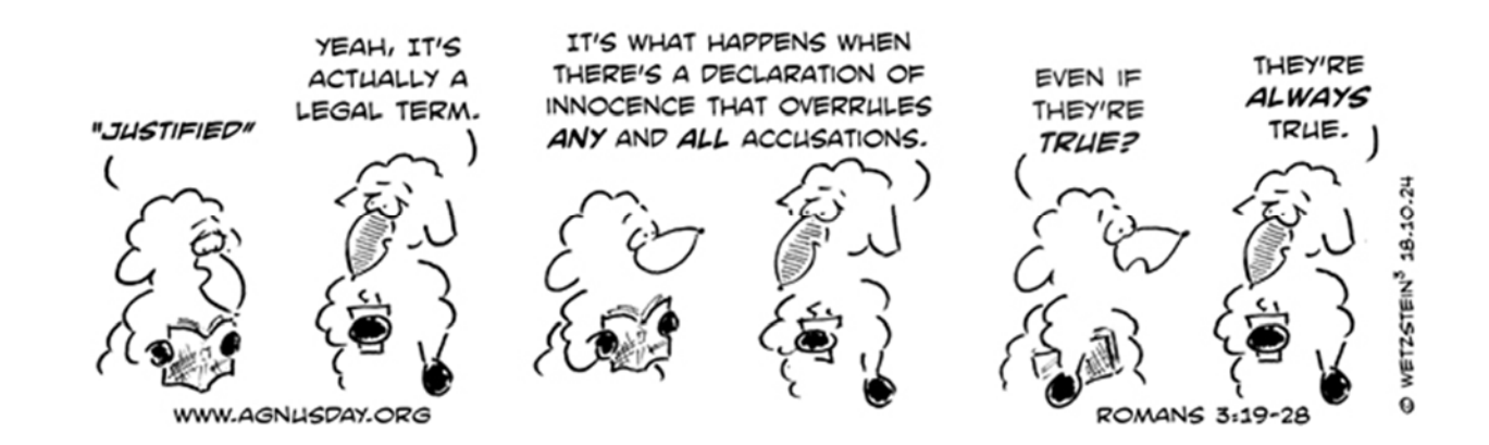
Romans 3:19-28 Happy Reformation Sunday, tomorrow, October 25th.