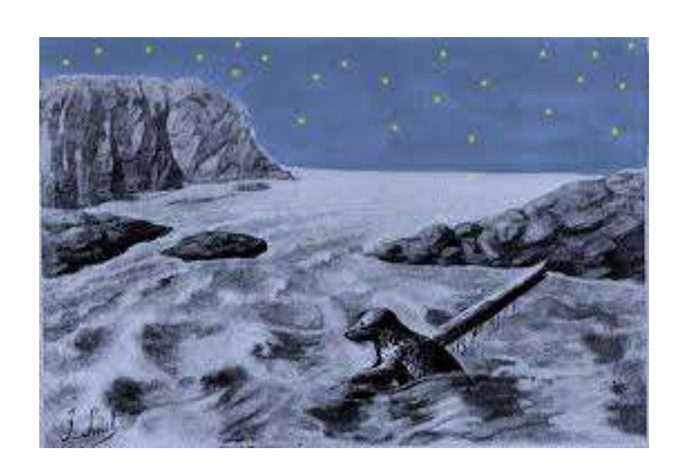
Oplatky for Christmas