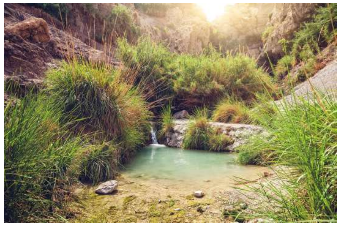
For waters break forth in the wilderness, and streams in the desert; the burning sand shall become a pool, and the thirsty ground springs of water... (Isaiah 35:6b-7a).

Join us every Sunday at 10:15 a.m. for continuing live streaming of the liturgy accessed through the website by clicking <u>HERE</u>.