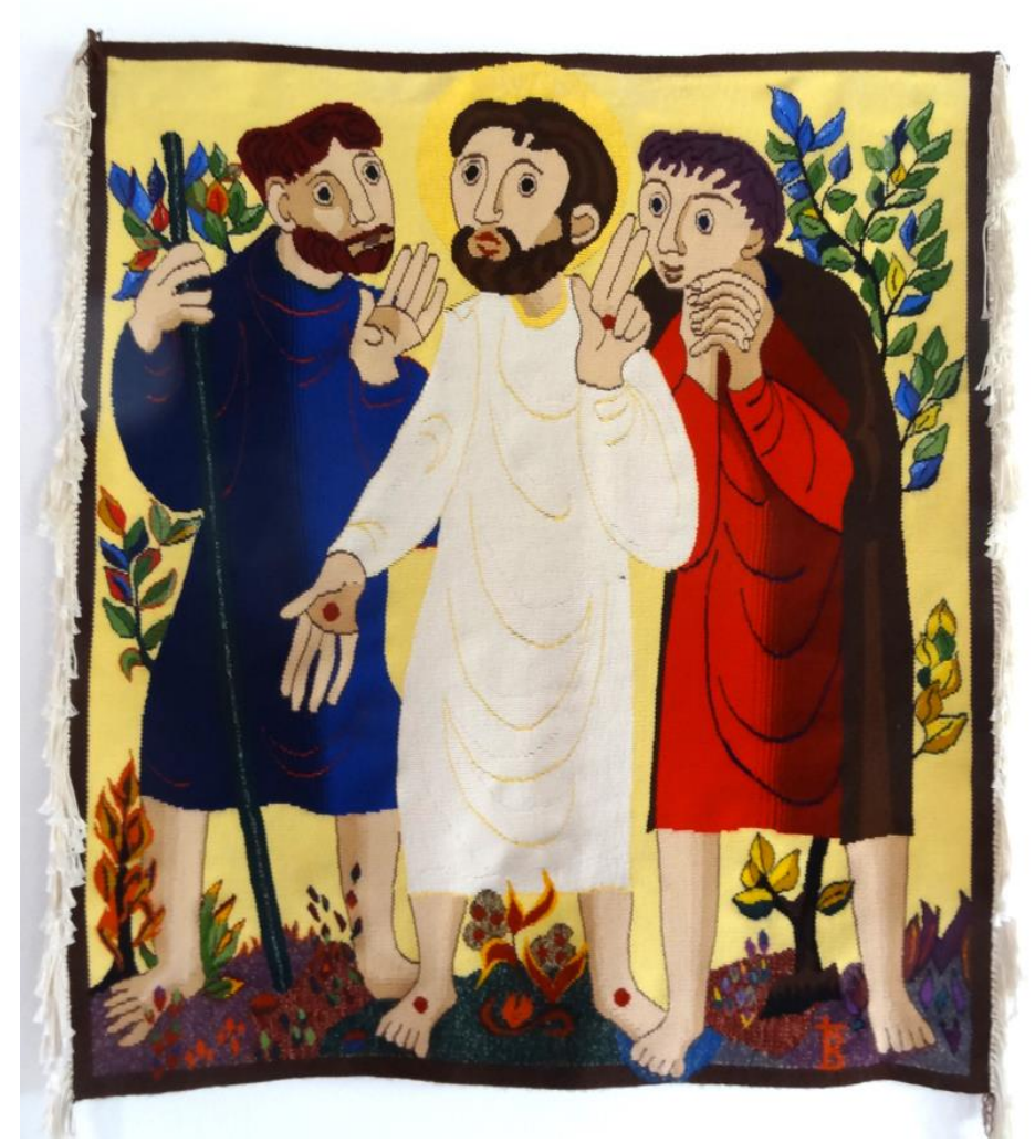
Risen Christ on the Road to Emmaus , after 1965. Bose Monastic Community. Textile. Magnano, Italy.