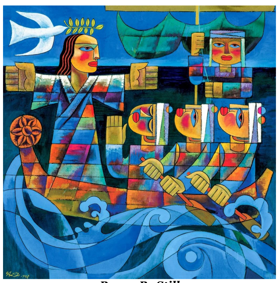
Peace, Be Still

by Chinese-born artist James He Qi depicts Christ stilling the waters in bold colors that recall stained-glass window. He blends Chinese folk customs and modern western art (1998).