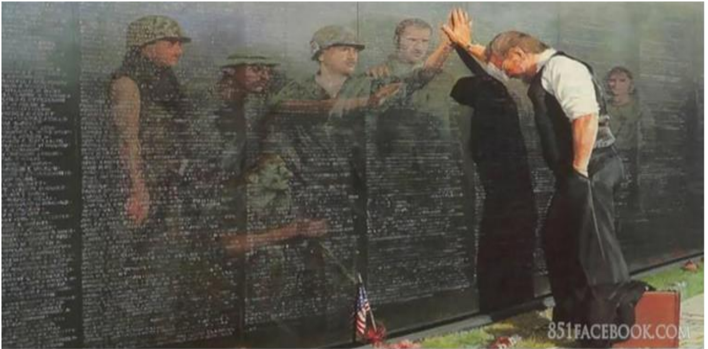
At the Vietnam War Memorial in Washington, D.C.

Eternal God, we give thanks for all those who have shown the greatest love by laying down their lives for others. We especially thank you for those in our military throughout history who have sacrificed their lives for their fellow citizens and for us who came after. As we remember their service, keep us mindful of all those for whom this day is a burden, and send your spirit of comfort to them. Be present with all the women and men who are serving in the military today. Let them live for the peace known only from you. Help us to be worthy of their legacy, and keep us mindful of their service, that in all things we may live our lives in praise and thanksgiving to you; through Jesus Christ, our Savior and Lord. Amen.