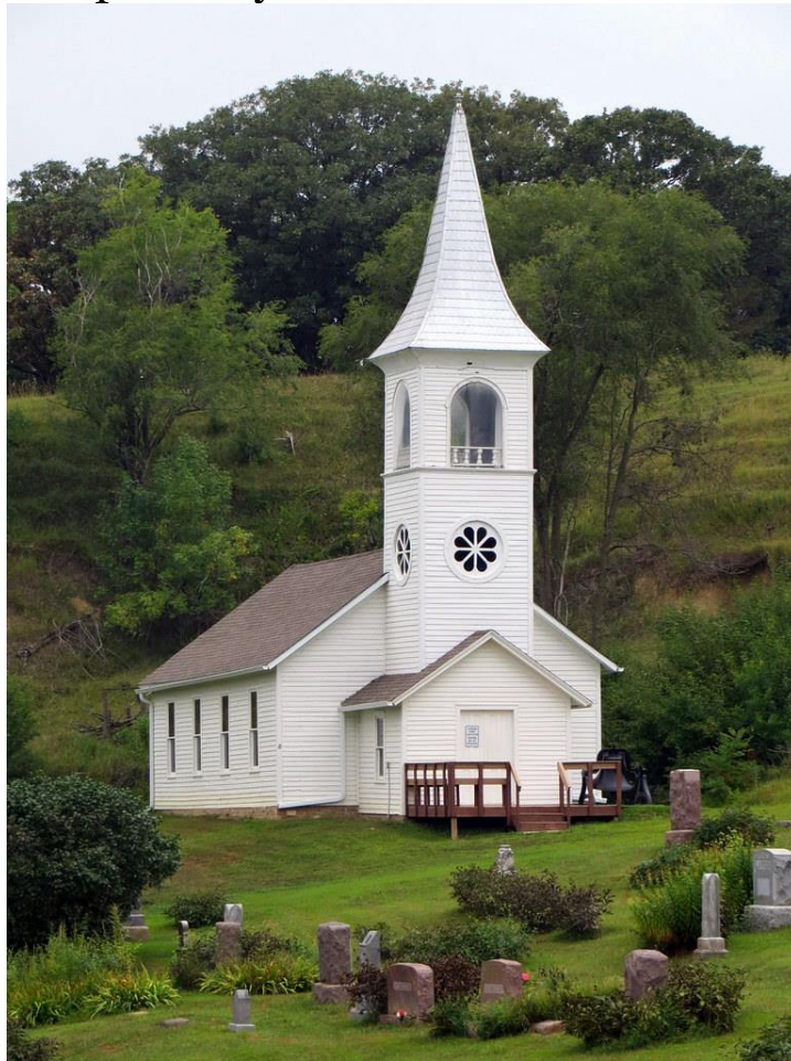
Ingemann Danish Lutheran Cemetery, Monona County, Iowa.