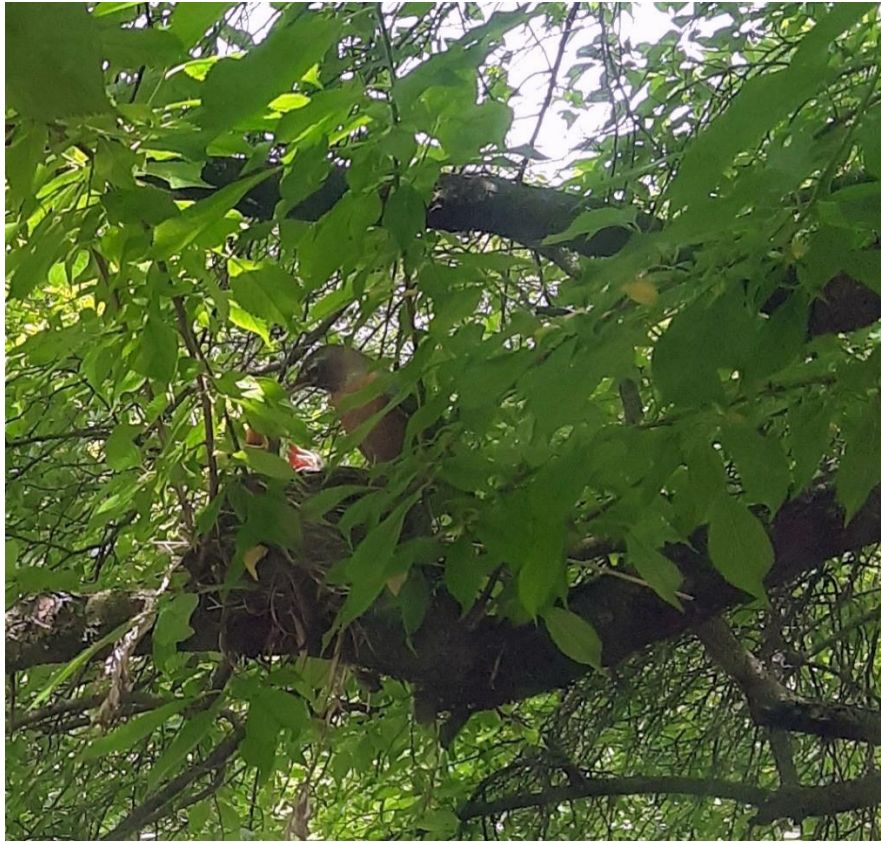
Above: Baby robins and mother in a plum tree outside the sun porch at the parsonage on Tuesday, June 9th. Below: Baby robins with mother and father on the same day.