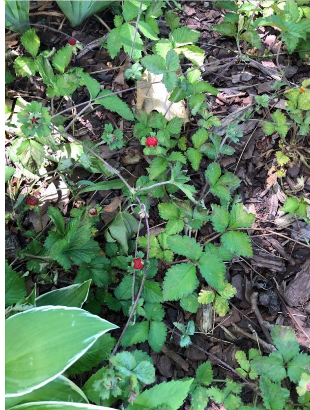
Wild Strawberries among the flowerbeds on the parsonage front lawn (almost enough for a spoonful).