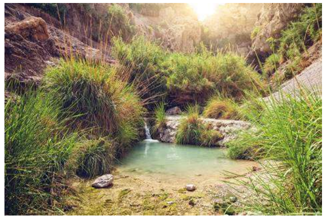
Streams in the Desert (Isaiah 43:19)