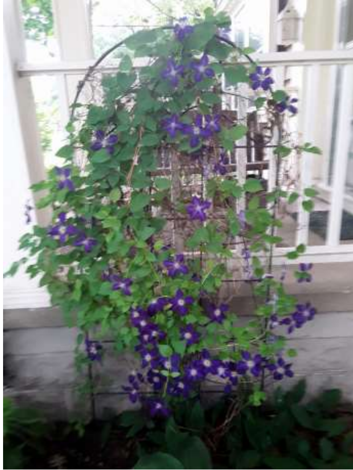
Clematis at the front entrance to the parsonage in June 2020. It has not blossomed like this in years!