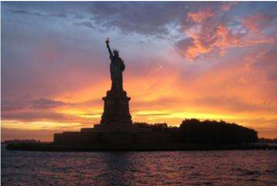
Sunset on The Mother of Exiles

The St. Louis Symphony Orchestra, Songs of America, Premieres "The Easy Winners," June 30th, HERE .