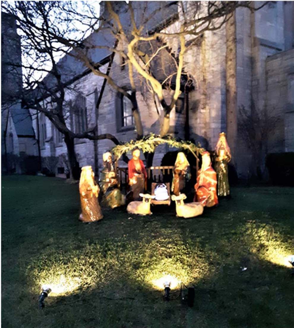
Newly refurbished creche at the Woodside entrance.