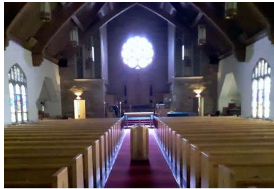
Please click on the following link at 10:15 a.m on Sunday mornings for live streaming of the liturgies and then later for recordings of these services: The Seventh Sunday after Pentecost July 19th, 2020

In this Place... A Virtual Tour of the Stained Glass at Sts. Peter and Paul (final segment in the series).