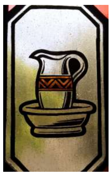
Baptismal basin and pitcher.