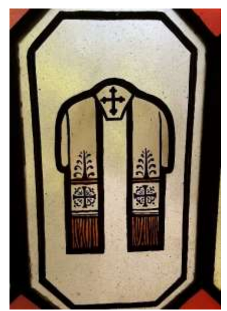
Pastor's surplice and stole.