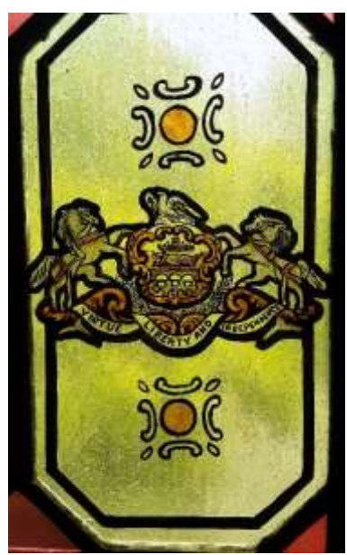
The Great Seal of the State of Pennsylvania. Can you guess why this seal is included in the pastor's study? (Answer below.)