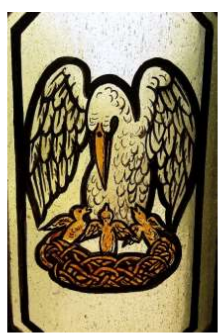
Stork feeding her young. (The stork is a Christian symbol representing holiness and vigilance and sometimes is symbolic of the Annunciation to Mary that she would bear the Christ child.)