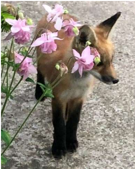
A fox family of six pups and their mother visited the parish in May while residing in the residential den below the church patio.