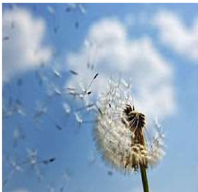
Seeds in the Wind.

We are called together by the Holy Spirit around Word and Sacraments to glorify God the Father, creator of all things, through our Lord Jesus Christ. We trust God to nurture lives of faith and hope, as we serve and give witness to the Gospel of Jesus Christ for the salvation of the world.