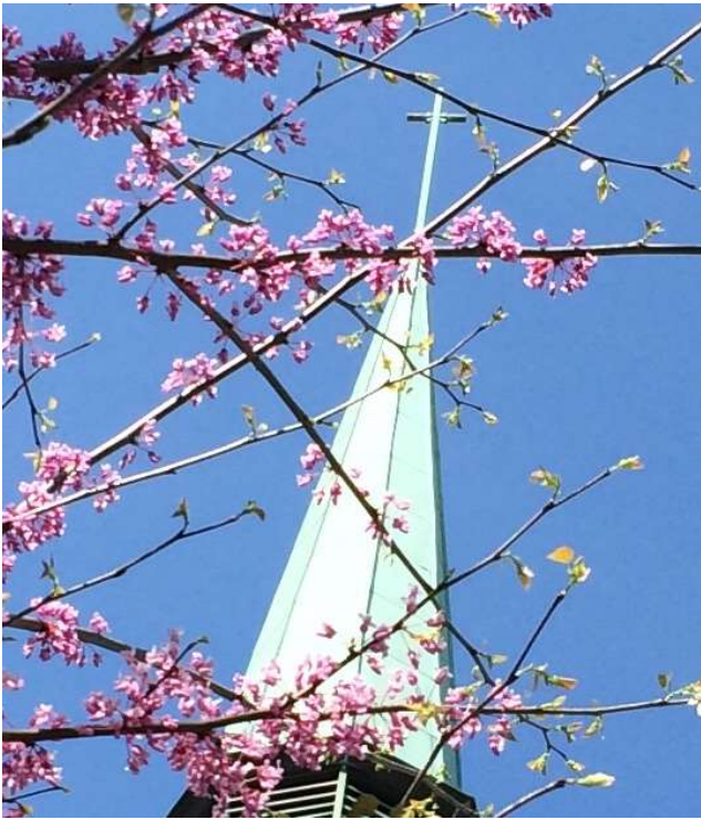
Redbud Spire, April, 2016.

Alexander's advisors were stunned by his unusually strange requests and asked that he explain. He is supposed to have replied, "I want the best doctors to carry my coffin in order to show that in the face of death, even the finest doctors in the world have no power to heal. I want the road to be strewn with my wealth so that everyone sees that material wealth will be left behind. And finally, I want my hands to swing in the wind so that people understand that we come to this world empty-handed and we leave this world empty-handed after the most precious treasure of time is exhausted."