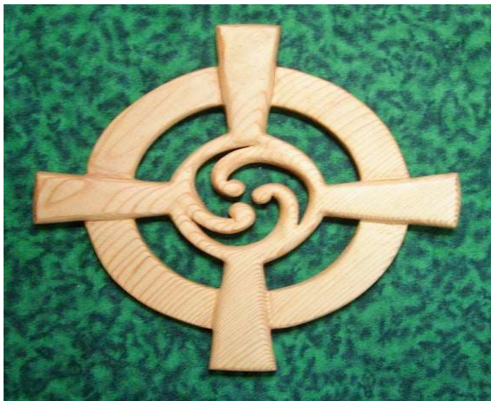
Celtic Triskelion: Sometimes used as a symbol of the Holy Trinity.