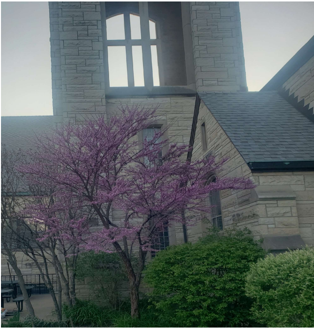
The rosebud tree at the patio entrance on Maplewood Road blossoming at sunset in May.