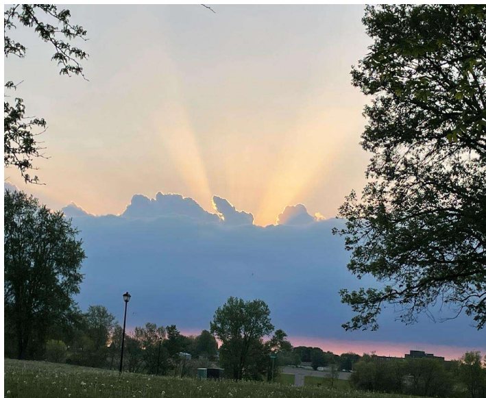
Sunrise through clouds during the month of May.

We are called together by the Holy Spirit around Word and Sacraments to glorify God the Father, creator of all things, through our Lord Jesus Christ. We trust God to nurture lives of faith and hope, as we serve and give witness to the Gospel of Jesus Christ for the salvation of the world.