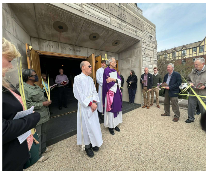
The blessing of palms at the Woodside entrance on Sunday, April 10 th.