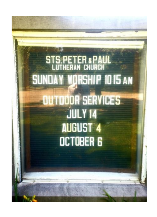
The Eighth Sunday after Pentecost, July 14th