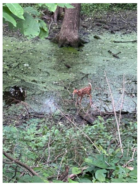
Birthing season on the Salt Creek.