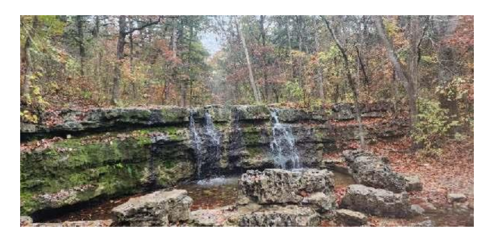
For waters break forth in the wilderness, and streams in the desert; the burning sand shall become a pool, and the thirsty ground springs of water... (Isaiah 35:6b-7a).