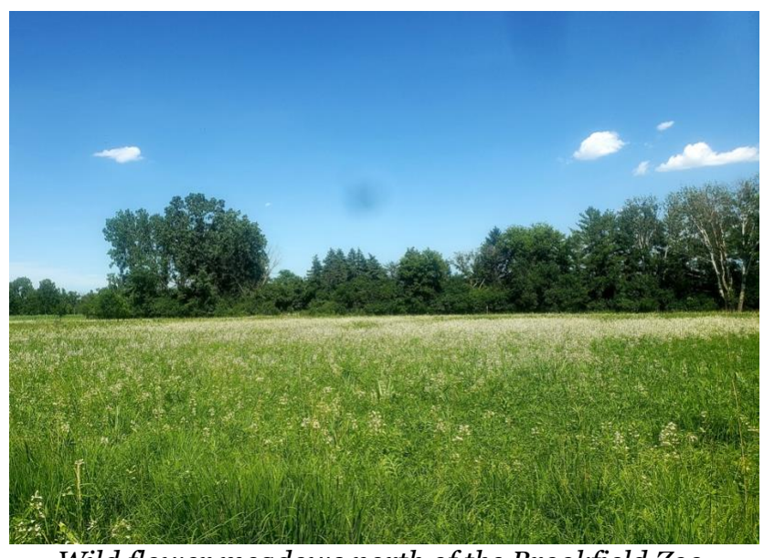
Wild flower meadows north of the Brookfield Zoo.