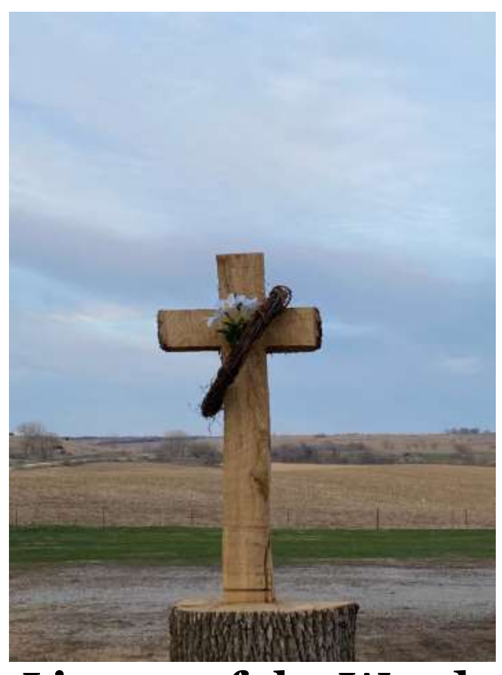
Liturgy of the Word, Reading of the Passion Narrative according to St. John and Veneration of the Cross