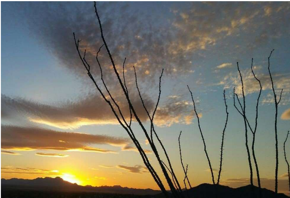
Desert sunset near Tucson.